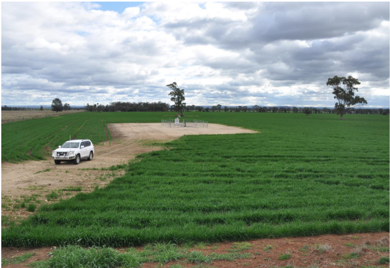
Santos/ACM Kahlua seam gas pilot, pad within barley crop – PEL 1 Gunnedah Basin (July 2020)