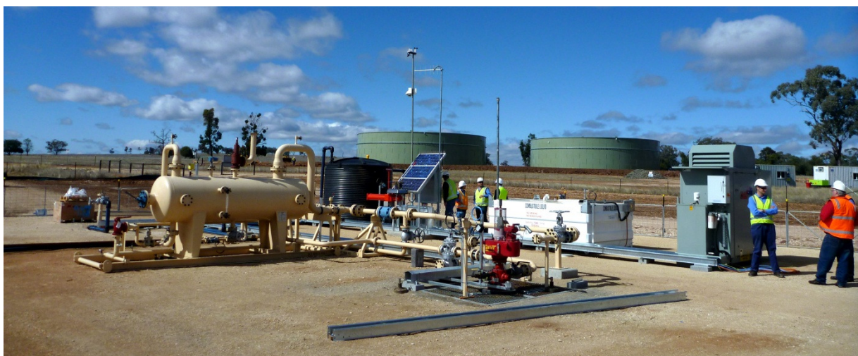
Santos/ACM Kahlua seam gas pilot – PEL 1 Gunnedah Basin